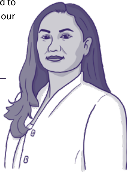
Hon Marama Davidson

The Action Plan has been developed to reflect this need. We will work with our community partners to refresh and update these actions.