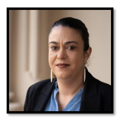
Kia ora koutou,

Welcome to the April edition of the Pānui, the bimonthly newsletter from Te Puna Aonui, which shares stories, updates, and opportunities in the government's family violence and sexual violence work programmes. Since the last Pānui, I have continued meeting with stakeholders across the nation – including HELP: Auckland, Tu Wāhine Trust, Counselling Services Centre, Family Action Whānau Ta, Korowai Tumanako, Dear Em, Upside Youth