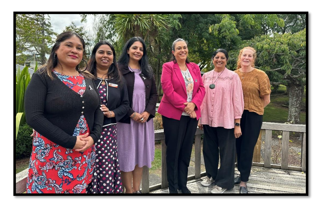
The Gandhi Nivas team at Papakura - one of three locations in Auckland.

I met with the Gandhi Nivas team at their Papakura site and learned about how they provide early intervention and prevention services for men at risk of committing harm in the family home. Nearly 60% of men who have been through the Gandhi Nivas programme have been prevented from reoffending. It's great to see how they work with the NZ Police, demonstrating initiative and connecting resources to those in need.